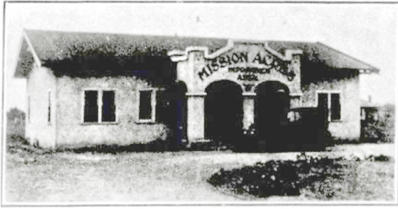
Mission Acres was a rural community in the northern San Fernando Valley. Its historic boundaries correspond roughly with community of North Hills.