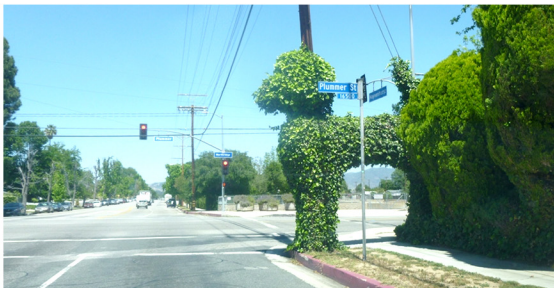
"Fido" stands guard on the N/W border of North Hills.

North Hills is one of the oldest communities in the San Fernando Valley. It was originally named Mission Acres. Area developers later changed the name to Sepulveda after the Sepulveda Family, whose roots trace back to the founding of the city. In 1992, the name changed to North Hills, it has since subdivided into East and West, divided by the 405 freeway.