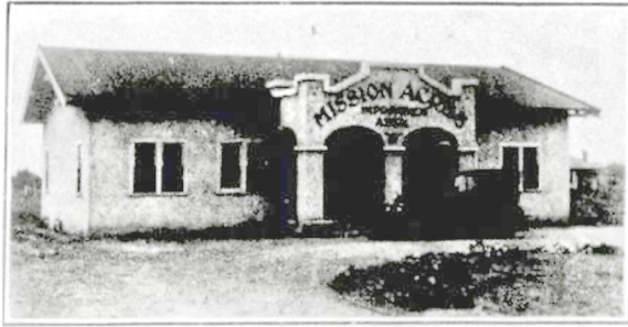
Mission Acres was a rural community in the northern San Fernando Valley. Its historic boundaries correspond roughly with community of North Hills.