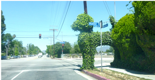
"Fido" stands guard on the N/W border of North Hills.

North Hills is one of the oldest communities in the San Fernando Valley. It was originally named Mission Acres. Area developers later changed the name to Sepulveda after the Sepulveda Family, whose roots trace back to the founding of the city. In 1992, the name changed to North Hills, it has since subdivided into East and West, divided by the 405 freeway.